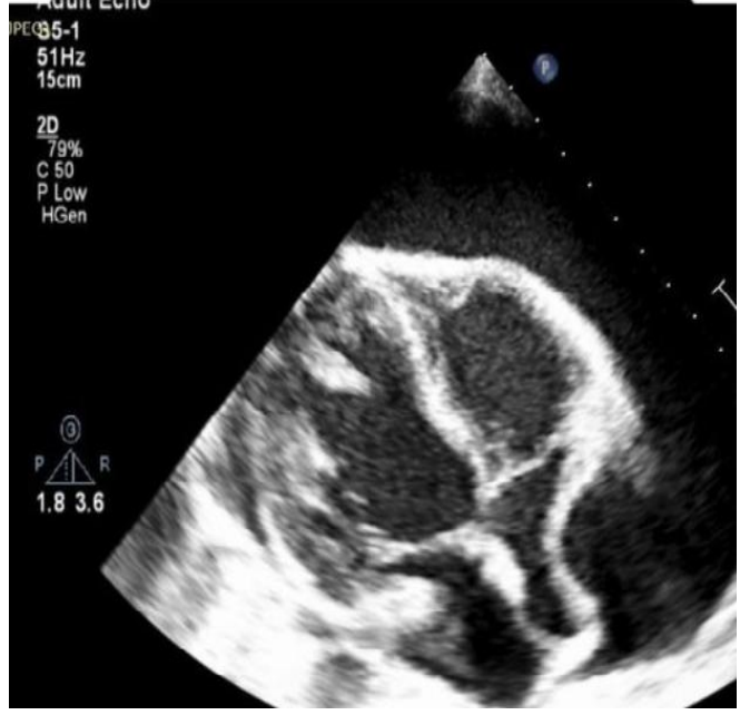
Figure 2. Echocardiographic image showing an important pericardial effusion with collapse of the right atrium

Chest auscultation showed decreased breath sounds. Transthoracic two-dimensional echocardiography revealed a large anterior pericardial effusion with respiratory variation in transvalvular flow on Doppler imaging and impaired right atrial and ventricular filling (Figure 2).