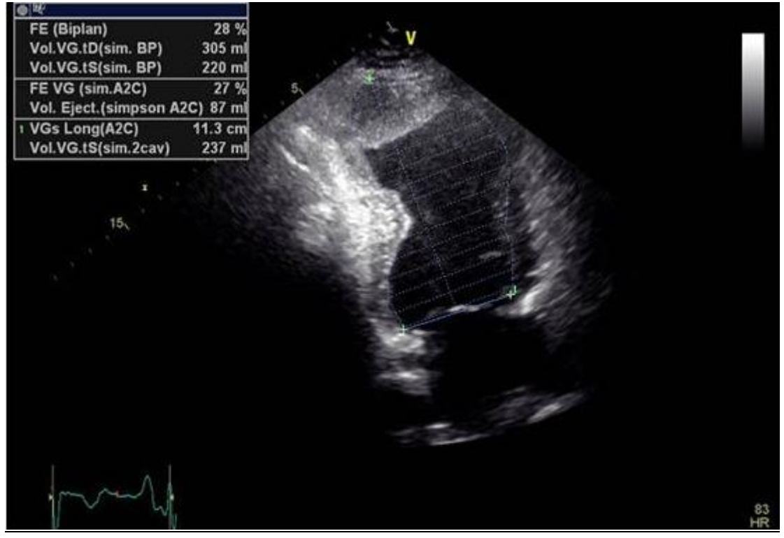
Figure 1: The incidence apical 2 Chambers showed a huge aneurysm of the left ventricle with apical thrombus.