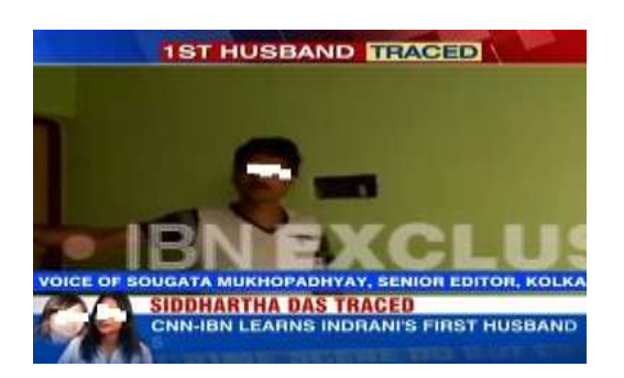
Fig 3:Mr SD, the first husband.

RA Journal of Applied Research ||Volume||1||Issue||08||Pages-322-336||Sept-2015|| ISSN (e): 2394-6709 | | www.rajournals.in DOI: 10.18535/rajar/v1i8.05