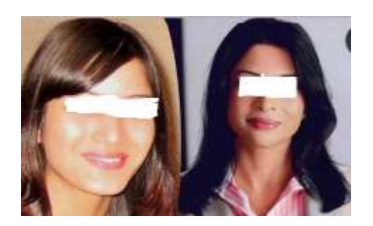
Fig 4: Mother and daughter.